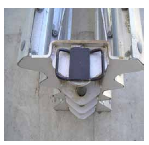
Easily interconnected to additional barriers with a single steel pin. No tools required

The Vulcan Barrier from Energy Absorption Systems, Inc. is a portable steel barrier that meets NCHRP 350 TL-3 & TL-4 and EN-1317 H2 & N2 test requirements as a longitudinal redirecting barrier for temporary and permanent applications. The barrier is available in effective lengths of 13.5 ft. (4m) and 40 ft. (12m). Vulcan Barrier can be deployed with multiple anchoring configurations, as a gate, or freestanding to accommodate any positive protection application for work zones or permanent applications. The system can be used with a variety of end treatments such as the QuadGuard, Quest or ACZ 350. Optional jacks with wheels can be added to the barrier to make it movable by hand or towed short distances with a vehicle. The lightweight and stackable design allows up to 540 ft. (160 m) to be transported on a standard 40 ft. trailer offering a huge transport savings compared to traditional concrete barrier. Vulcan Barrier can also be configured as a manually operated gate system to create an opening in any median or roadside longitudinal barrier.