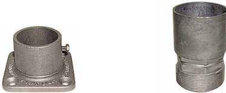
Figure 2. Examples of Frangible Couplings

b. Common applications of frangible couplings (Figure 2) are found in light posts, masts, and electrical metallic tubing (EMT) supports for runway and taxiway lights (See ACs 150/5345-44, 150/5345-46, and FAA Drawing C-6046 for frangibility requirements). It is important to recognize that many types of frangible couplings are available, and only those types approved for the purpose or application originally intended should be used.