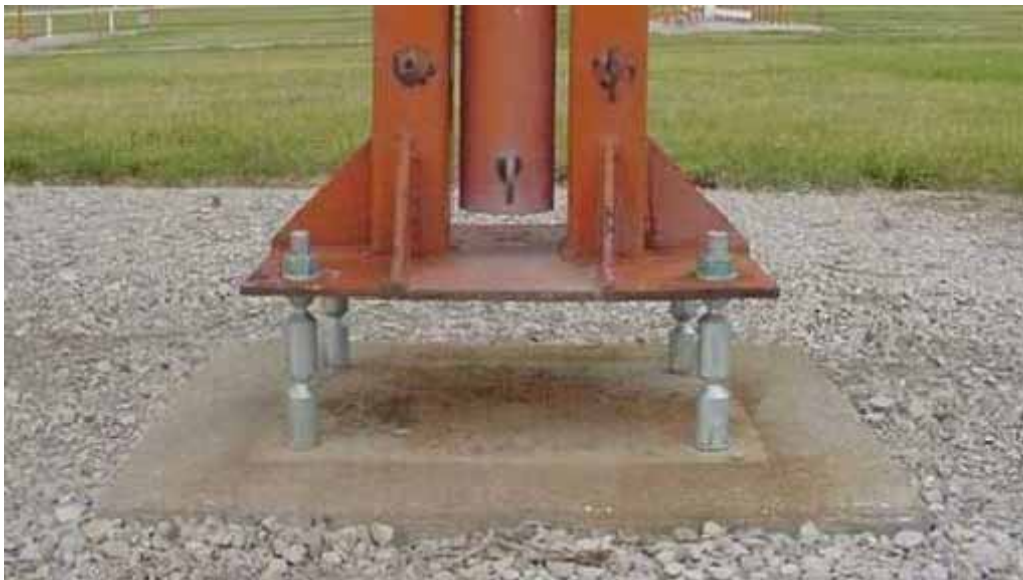
Figure 1. Application of Fuse Bolts

a. Failure of this type of connection is induced by providing a “stress raiser,” due to removal of material from the bolt shank. One method used to achieve this is to machine a groove to reduce the bolt diameter or to machine flats in the sides of the bolts, making it weaker in a specific direction. Shear strength is maintained and tensile strength is reduced by machining a hole through the bolt diameter and locating it out of the shear plane. Fuse bolts must be carefully installed to ensure they are not damaged or overstressed when tightened. One disadvantage of fuse bolts is that the stress raiser may shorten the fatigue life of the bolt or may propagate under service loads and fail prematurely. Fuse bolts with machine grooves are commercially available. See Figure 1 as an example of the application of such fuse bolts. (Reference ICAO Aerodrome Design Manual , Part 6, Section 4.5.2.a)